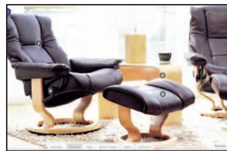
Kensington page with info buttons